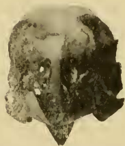
Malformed bill of Rose-breasted Grosbeak